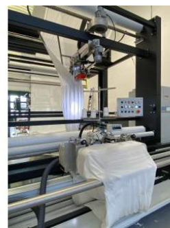
TUBOLARE CON TAGLIO PER APERTURA TUBULAR WITH SLITTING